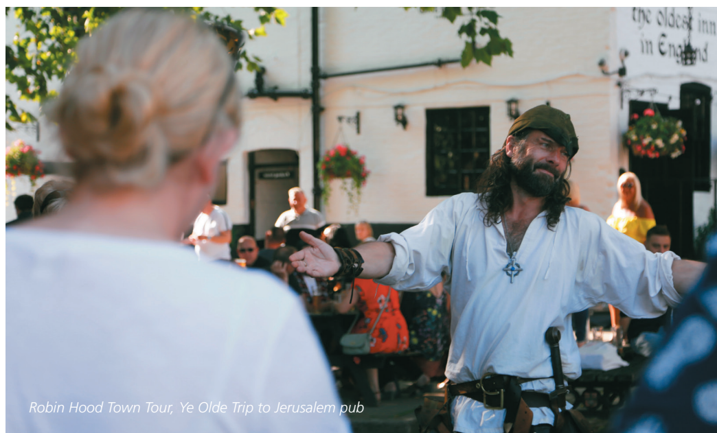
Robin Hood Town Tour, Ye Olde Trip to Jerusalem pub

Accessibility: The tour includes a visit to an underground cave, which is only accessible via steep, medieval stone steps. If this will be a problem for guests, the tour can be adapted to avoid this point of interest.