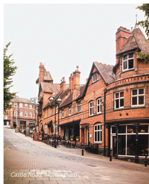
Castle Road, Nottingham

Note: After a major renovation project, Nottingham Castle will re-open in spring 2020 and will feature a Robin Hood exhibition, adventure playground, cave tours and galleries relating to Nottingham's rebellious history.