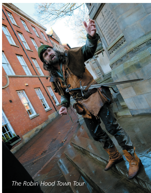
The Robin Hood Town Tour