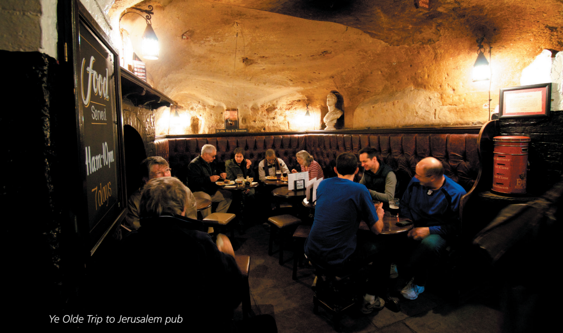
Ye Olde Trip to Jerusalem pub