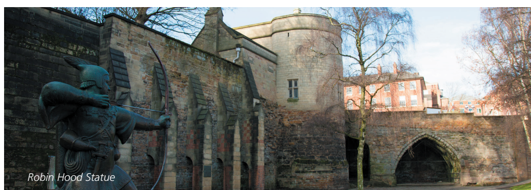
Robin Hood Statue